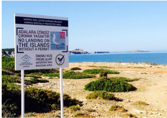
Figure 6. In 2015 KUŞKOR placed signs at launch sites and around the peninsula informing the public of a ban on landings and police were notified. The signs include a hotline to the TRNC Department for Environmental Protection to whom illegal landings can be reported.

In 2016 rod fishers were recorded on the islands during surveys in May; the signs had been ignored. However, KUŞKOR raised this with the Dipkarpaz police who became more familiar with the law during our increased visits to the islands, when the KUŞKOR team would stop at the police station to discuss field work and confirm our permission documents. The KUŞKOR team were stopped by police while deploying rat surveillance gear on Zinaritou in January 2017 and during eight surveys that year, no fishers were present on the islands. The signage and lobbying therefore seem to have been effective, and landings are no longer common.