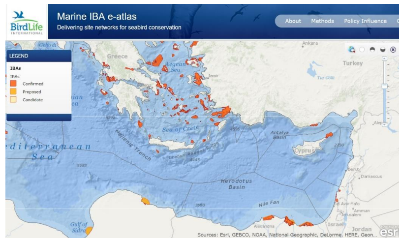
Figure 7. Kleides and Aphenrika Islands form part of a network of 300 Marine Important Bird Areas across the World's oceans and seas.

In 2014 an area of the Karpaz peninsular and the Kleides Islands were designated as an Important Bird and Biodiversity Area (IBA) 14 and the Kleides and Aphenrika Islands and their offshore areas became Marine IBAs 15 . The designation was on the basis of data provided by KUŞKOR and Birdlife Cyprus and through an EU Civil Society Support grant implemented by KUŞKOR. The criteria used for selecting IBAs at the European level (C-criteria) are directly aligned with the criteria used for selecting Natura 2000 SPAs. Thus, reinforcing the potential designation of the Karpaz potential SPA. Again, disturbance caused by anglers was listed among key threats at the islands.