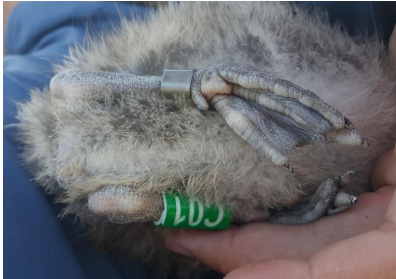
Figure 7. In 2017 seven Audouin's Gull chicks were fitted with colour rings through the KUŞKOR ringing scheme.

During these landings, several deserted nests with added eggs and depredated chick carcasses were observed. They were not systematically recorded as the landing duration was limited to 15 minutes to minimise disturbance.