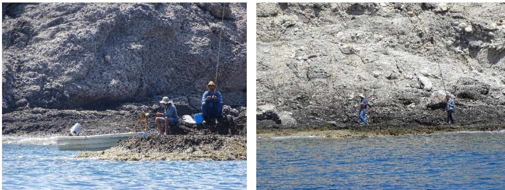
Figure 4. Two groups of rod fishers illegally landed on Kasteletta during a 2016 survey disturbing the nesting seabirds.

Disturbance by humans landing on the islands has been cited as one of the greatest threats to the breeding of these seabirds and one which is likely to have led to the decline of Audouin's and Yellow-legged Gull. When the gulls are disturbed they flush from their nests leaving eggs and young exposed to predation. During a census in 2016 when the islands were monitored by boat, rod fishers were seen fishing from rocks near to nesting birds (Fig. 4). On one occasion, two fishers crossed from the landing site on the north of Kasteletta, to fish on its southern side and back again, via the centre of the Yellow-legged Gull colony. The human population of Cyprus is growing, people increasingly have spare time and greater expendable income and amateur fishing using rods, fiberglass vessels and spear guns is gaining interest. Fiberglass vessels are trailered to launch sites on Zafer Burnu for fishing on and around the remote islands. An organised "survivor" camp held on the island in spring 2013, was reported through social media. People were photographed handling the chicks and eggs of gulls during the weekend long event. Recent legislation forbids landings and the new laws seem to be being upheld; no people were seen using the islands during intensified surveys by KUŞKOR in winter and spring 2017. The public are probably more aware of the threat to seabirds, due to awareness raising, signage erected by KUŞKOR around the peninsular and the efforts of Dipkarpaz police.