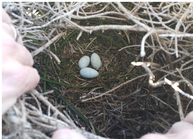
Figure 3. On Kasteletta Island Mediterranean Shags build their nests in tunnels beneath dense vegetation, January 2017.

To date, no complete census of the Kleides Island Mediterranean Shag has been undertaken during the breeding season, which is in December through March, but our census suggests that nest numbers are stable with 20-80 juveniles counted annually during our May census. During January and February 2017, KUŞKOR were permitted to land on the islands to undertake surveys for rodents. During this period, shags were observed to be nesting in tunnels that are maintained by the shags under dense vegetation, where they likely find shelter from predators such as Peregrine Falcon (of which at least one pair is resident on the islands), migratory birds of prey and the sympatric Yellow-legged Gulls (Fig.3).