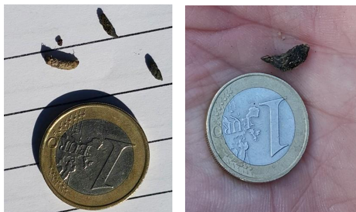
Figure 7. Droppings found in bait boxes on Kasteletta (left) were attributed to mice whilst larger droppings found on Zinaritou (right) were attributed to rats. Droppings on Zinaritou were few and may also have been gnawed or eaten by rats.