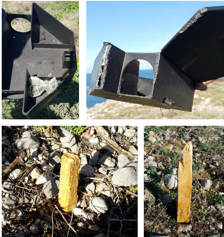
Figure 6. (Clockwise) Consumed bait and droppings in bait box places on Kasteletta. Heavy gnawing to a bait box and to two chew sticks placed on Zinaritou.

gnawing to chew sticks. However, at Zinaritou, bait had been completely consumed from both bait boxes and both boxes had been gnawed heavily, to the extent that they were no longer functional (Fig. 6). Large gnaw marks and relatively large faecal remains in bait boxes were attributed to rats (Fig. 7). Chew sticks were heavily gnawed (Fig. 6). These results lead us to conclude that Kasteletta hosts a population of mice and that Zinaritou hosts a population of rats. The presence of mice on Kasteletta rules out the presence of rats, and rats on Zinaritou rules out the presence of mice, since on such small islands rats and mice do not co-exist.