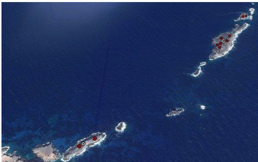
Figure 5. Distribution of baited rat boxes and chew sticks (red) and additional chew sticks (white) deployed by KUŞKOR in January 2017 to test for the presence of rodents.

The black rat Rattus rattus and other rodent species have led to declines in the world's seabird populations 11 and their human introduction to seabird islands can have profound impacts on these important ecosystems, affecting plant and invertebrate diversity 12 . In 2017 KUŞKOR landed on the islands during January and February to survey the islands for rodents. In January, we deployed bait boxes loaded with rodenticide and hammered wooden stakes pre-impregnated with vegetable oil into the soil, or in the case of Kleide Rock into rock crevasses (Fig. 5). In February, we made a second landing to inspect and collect the boxes and stakes.