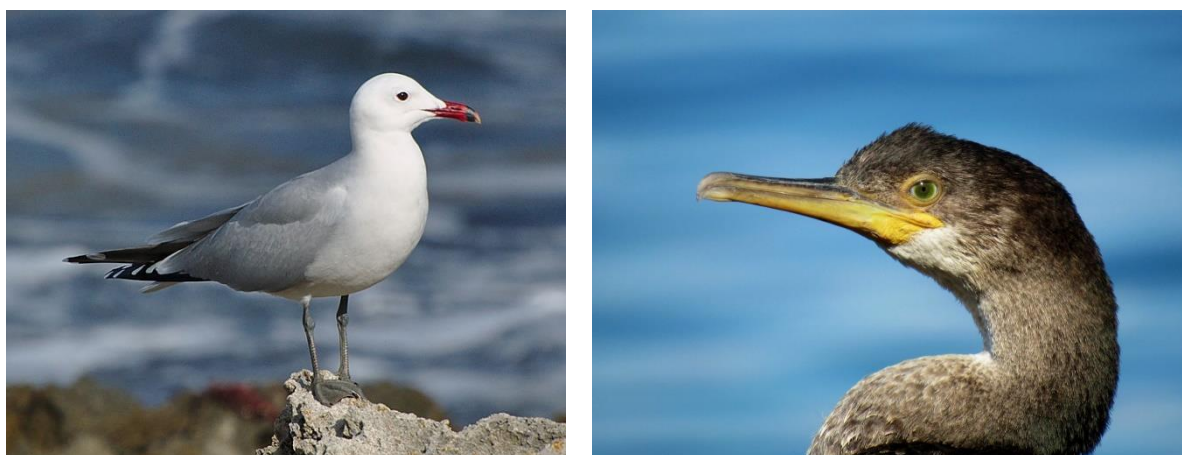
Figure 2. Audouin's Gull and Mediterranean Shag are both protected by international directives and conventions.

The Mediterranean Shag, a sub-species of the European Shag, is also listed on Annex I of the EU Birds Directive and carries a Species Action Plan of the Bern Convention and therefore requires conservation action to be undertaken by EC and EU member states. It has a population of less than 10,000 pairs.