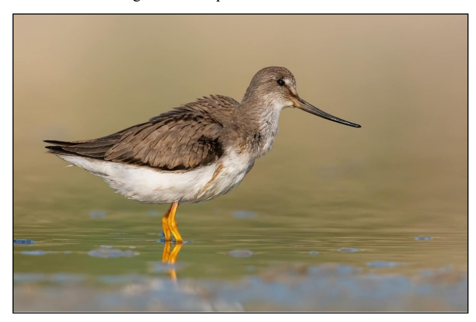
Terek Sandpiper - Terek Sandpiper (AV; scarce; EU birds directive Annex I) One at Kukla wetlands August 30 to September 3.

Terek sandpiper at Kukla Wetlands from August 30 to September 3. Eren Aksoylu.