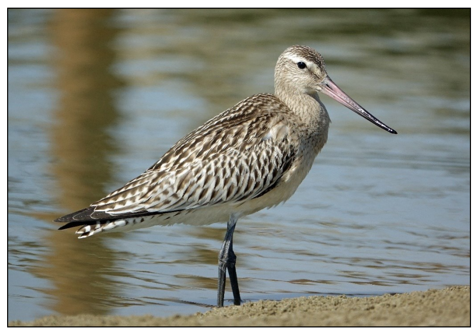
Bar-tailed Godwit at Glabsides on September 19. Nick Pegler.