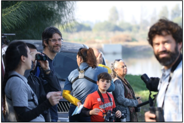
Above: KUŞKOR board and BirdLife Cyprus staff undertook a training meeting for volunteers on wetland monitoring as part of the Cyprus Wetland Monitoring Scheme.

In January we again undertook an island-wide waterbird census contributing to the International Waterbird Census with BirdLife Cyprus. More than 30 surveyors covered 78