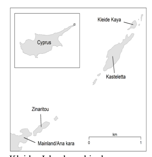
Kleides Islands archipelago.

The low success in 2021 and 2022, when the audouin's gulls nested at Kleide Kaya and Kasteletta respectively, may be due to their proximity to the larger colony of Yellow-Legged gulls at Kasteletta Island, which prey on the eggs and young of Audouin's Gulls where they nest proximally. Given these results and the results of recent fledging counts, KUŞKOR are resolved to continue to follow the management plan they have developed for this site<sup>6</sup>, and implement biosecurity measures and monitoring at Zinaritou. KUŞKOR will now also begin social attraction measures, initially with decoys. Our aim is to encourage the Audouin's Gulls to re-colonise Zinaritou, where their numbers were previously >40 pairs and where their breeding success was reported to be favourable. KUŞKOR have recently found Aphendrika Island, north of Dipkarpaz, where Audouin's Gulls formerly bred, to also be ratted. Therefore, during the winter of 2023, in collaboration with the authorities, we will seek funds to implement biosecurity measures there also.