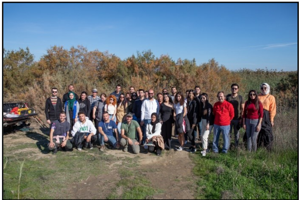
Second Annual Cyprus Bird Camp

In October 2022, funds were granted to KUŞKOR by OSME Youth Development Fund, to organise and implement a second Autumn Bird Camp on Cyprus in partnership with BirdLife Cyprus. Seventeen young people from three Cyprus schools (Famagusta, Kyrenia and Nicosia Turkish Maarif College; TMK) participated in the weekend-long event which began on Friday 4th November and ended on Sunday 6th November. The camp toured some of the Important Bird Areas of Cyprus, providing a solid introduction to birding and conservation. At least 55 bird species were encountered during the camp.