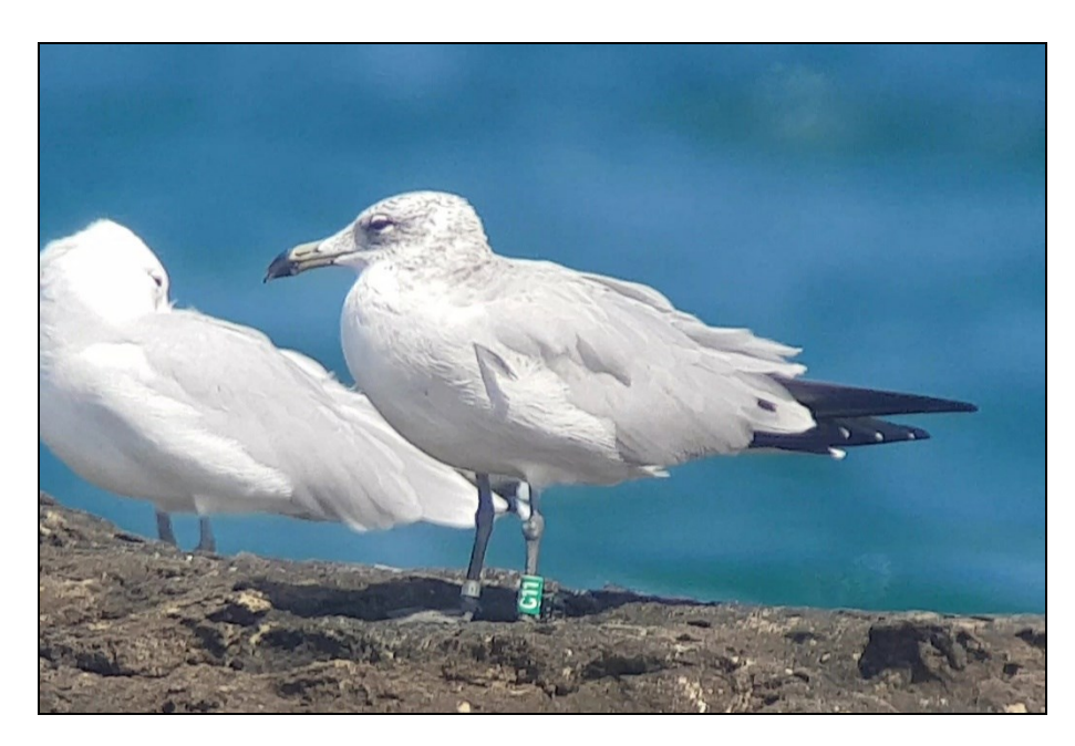
Audouin's gull C11 on islets of Alagadi beach on September 22. Nick Pegler.