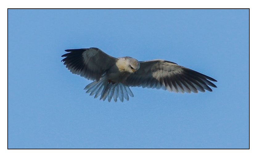
Juvenile black-winged kite at Yeni Erenköy on 22 January. Hüseyin Yorganci.

Two winter records from Yeni Erenköy on January 22 (first year bird) and February 20. One at Gönyeli reservoir on October 06.