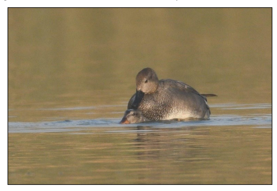
Gadwall mating at Kalkanlı Reservoir on January 1. Roald Koudenburg.

and bred there for the first time, which was confirmed by a pair observed with five ducklings on May 20. Mating was also observed at Kalkanlı Reservoir on New Years Day. Fourty-two at Kalkanlı Reservoir January 15 and 36 two days later. Sixteen at Kukla Wetlands January 15, increasing to 53 by February 20, and down to two by April 25. Twenty-one, consisting of nineteen young and two females on June 15, while seven July 2.