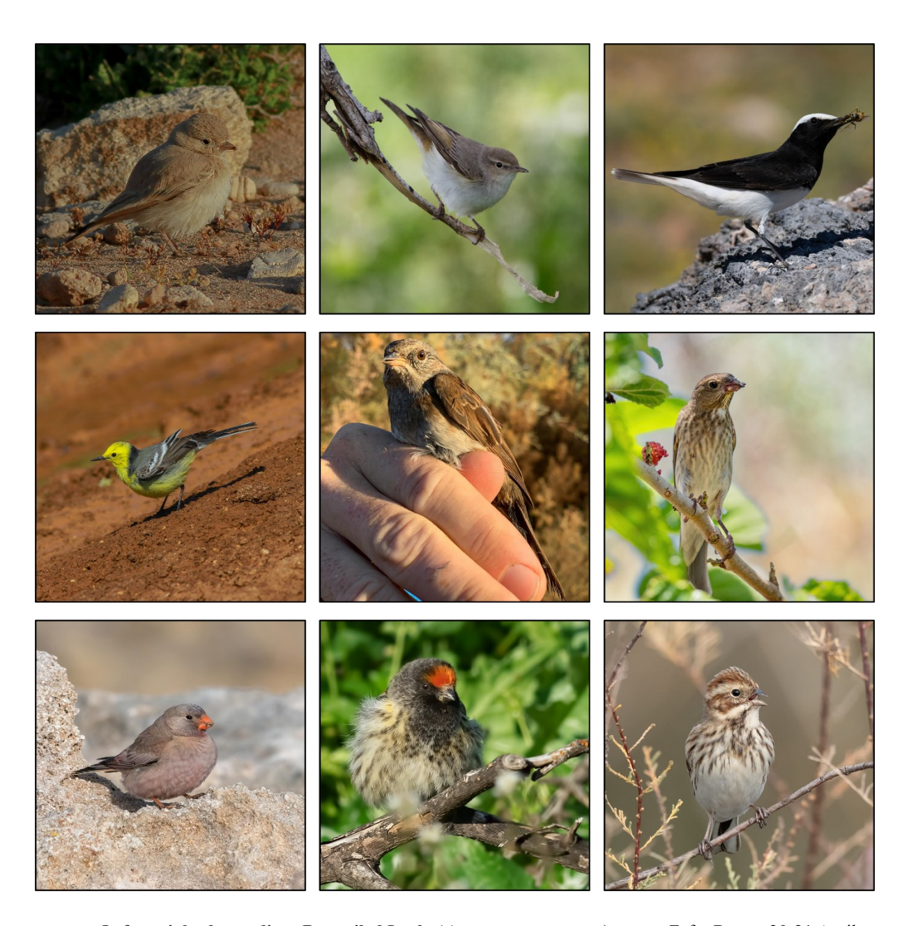
Left to right descending: Bar-tailed Lark (Ammomanes cincture), one at Zafer Burnu, 20-21 April, Hüseyin Yorgancı; Eastern Bonelli's Warbler (Phylloscopus orientalis), one at Sadrazamköy, April 6, Birtan Gökeri; Hooded Wheatear (Oenanthe monachal), one at Dipkarpaz – Zafer Burnu on April 13-15, Neslihan Taylan Tulbentci; Citrine Wagtail (Motacilla citreola), at Yeni Erenköy on March 27, Hüseyin Yorgancı; Dunnock (Prunella modularis), one ringed at Balıkesir pools on December 18, Hüseyin Çamlıca; Common Rosefinch (Carpodacus erythrinus), Sadrazamköy, Ali Özdinç; Trumpeter Finch (Bucanetes githagineus), one on Dipkarpaz coast April 2, Eren Aksoylu; Fire-fronted Serin (Serinus pusillus), one at Kukla Wetlands on February 26, Elçin Yoldaşcan; Reed Bunting (Emberiza schoeniclus), one at Haspolat Sewage Works on December 10, Neslihan Taylan Tulbentci.

Images are included below to illustrate records of scarce or vagrant passerines recorded during 2022, while others can be found in Appendix II.